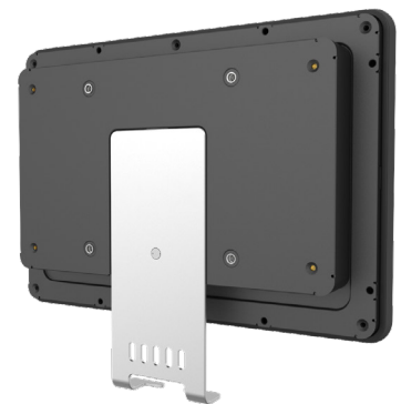
VESA MOUNT 100 X 100MM